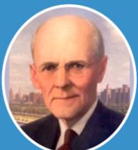
Rtn. Paul Harris Founder